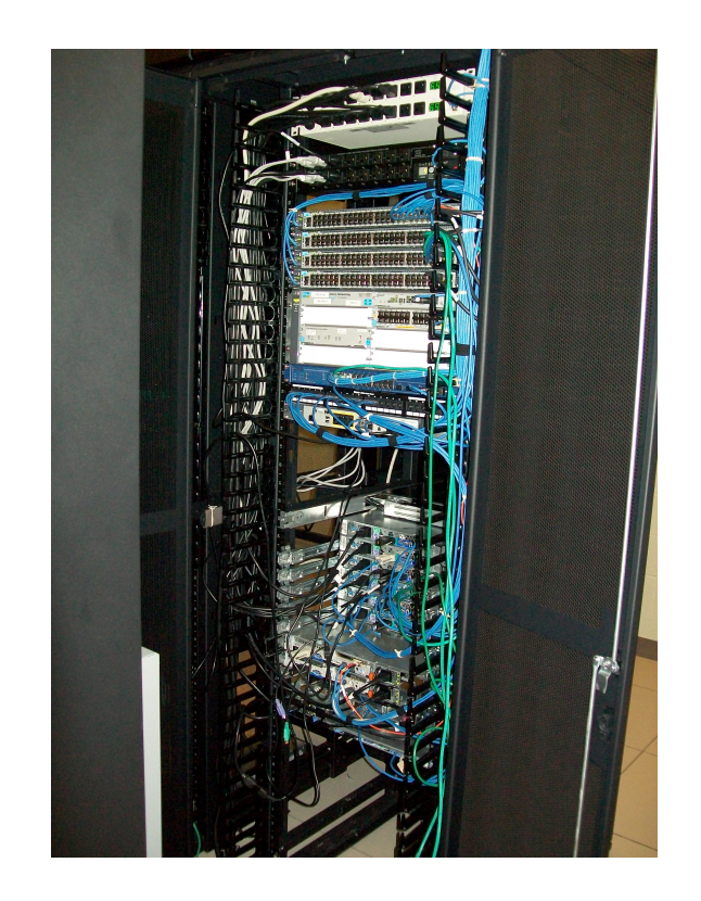
HP ProCurve 6600s in Bloomington Data Center Test Lab