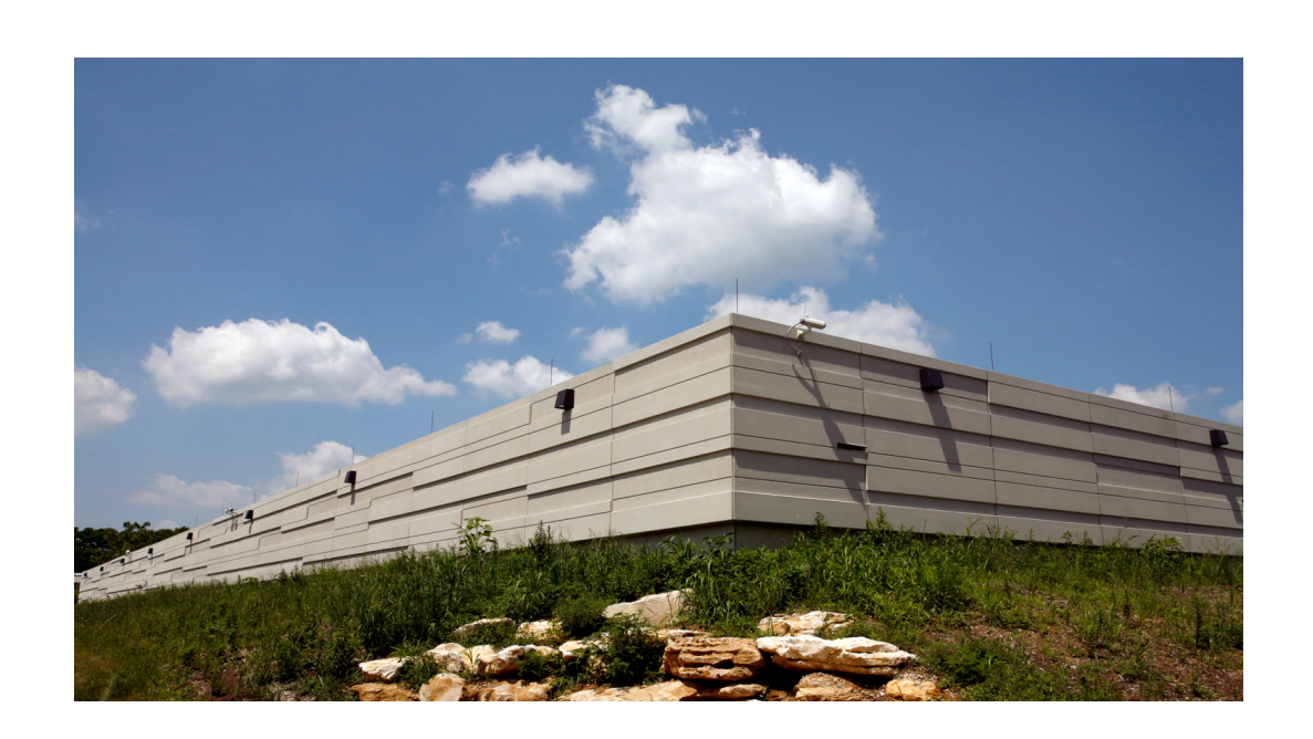
Bloomington Data Center