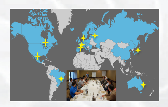
National and International Cyber-Infrastructures Federate with GENI

Campus IT, R&E Network Operators Host and manage GENI resources Provide wide-area network connectivity